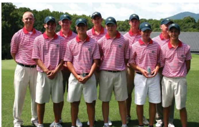
The 2011 Virginias Junior Boys Team