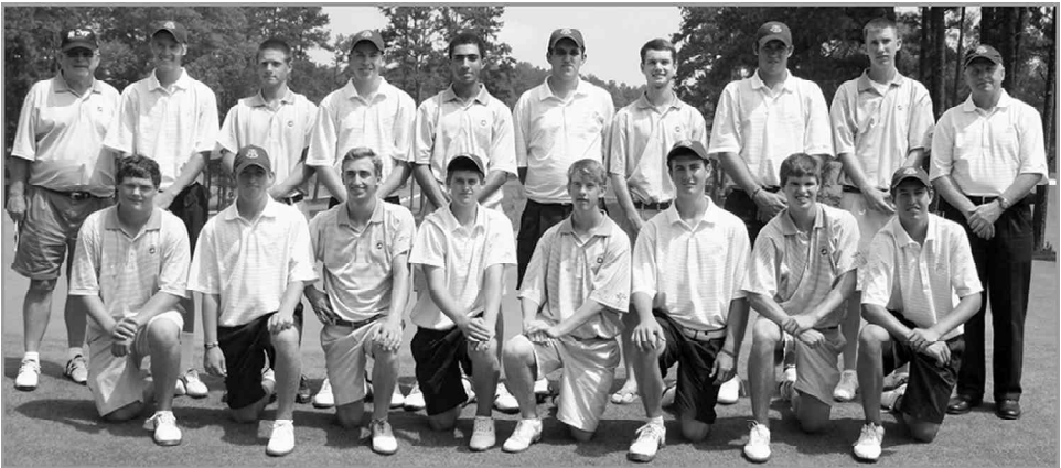
The Junior Boys Team Matches have been an annual tradition since 1983. In the photo above the Carolinas Team poses with their Virginias counterparts. The Carolinas Boys are wearing hats.